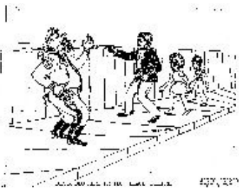
Click for full size picture. (12K)